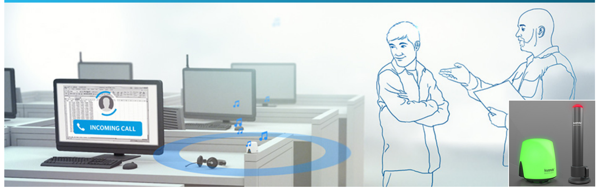
kuando Busylight UC.